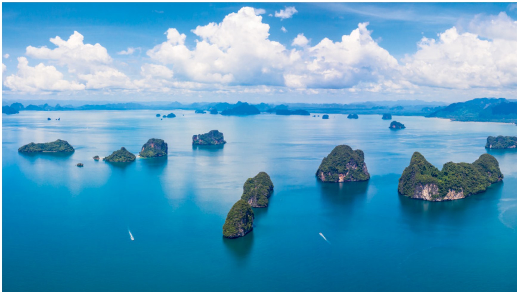
Clockwise from above: Chart a course around the surrounding islands of Koh Yao Noi; The views from the terrace of a Pool Suite, soaking up the limestone karsts and islands of Phang Nga Bay; So many places to sleep, relax and recline, from the bed, to the plunge pool, to a deep soak bath