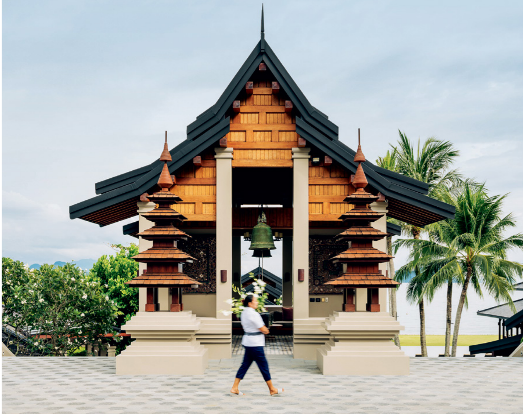
Clockwise from above: Every aspect of Àni Thailand has been designed to maximise the breathtaking views of Phang Nga Bay, from its arrival pavilion and 43-metre saltwater pool to the suites that survey the landscape; A chic private beach picnic on an 'undisclosed' island; Breakfast in a rice paddy field; The open-sided Dining Sala; Swimming Macaques feast on bananas; One of Chef Yao's masterpieces