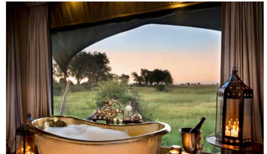
↑ Luxury adventure. Creature comforts are not neglected during this epic safari trip.

Conscious that the A319 Executive Private Jet creates a significant carbon footprint, Roar Africa will be carbon-neutral with high-quality offsets including installation of 69 solar panels in villages in Rwanda, planting 1,300 trees and access to fresh water for 3,000 people in Kenya, and funding the protection of a rhino calf through Rhinos