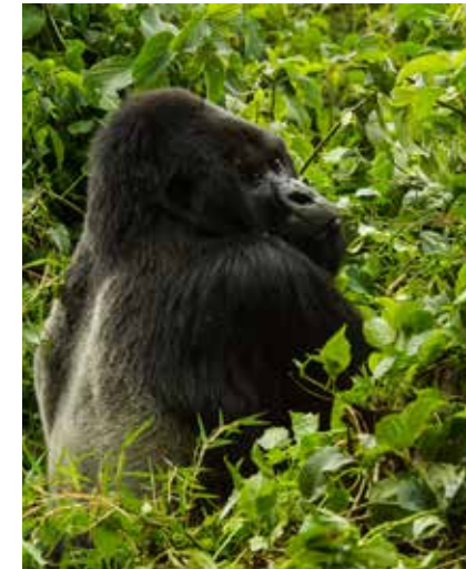
↑ Wildlife protection. Roar supports the protection of wildlife through targeted, grassroots organisations.

"THIS EXPERIENCE SETS A NEW PARADIGM IN ULTRA-LUXE ADVENTURE AND SUSTAINABLE TRAVEL AND IS A CATALYST FOR CHANGE."