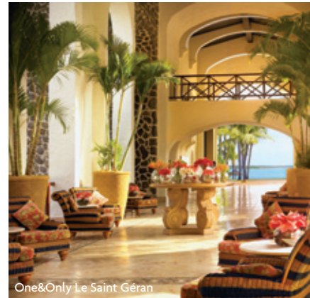
One&Only Le Saint Géran