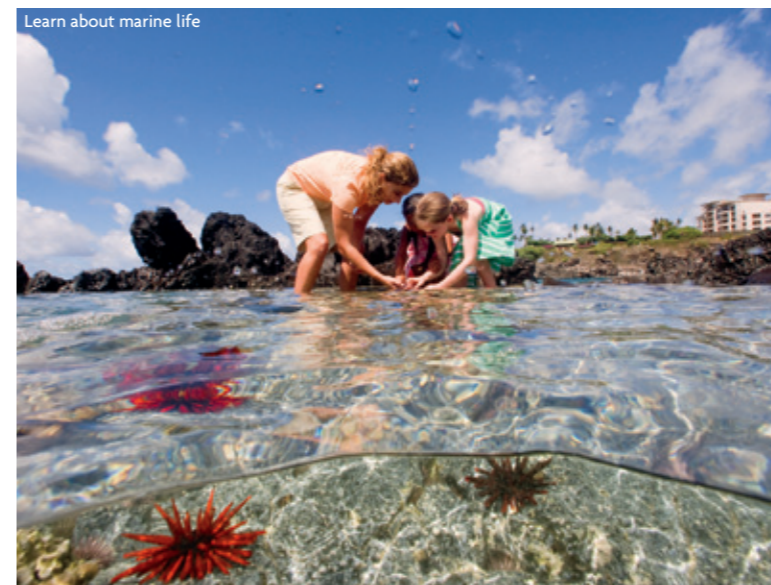
Learn about marine life