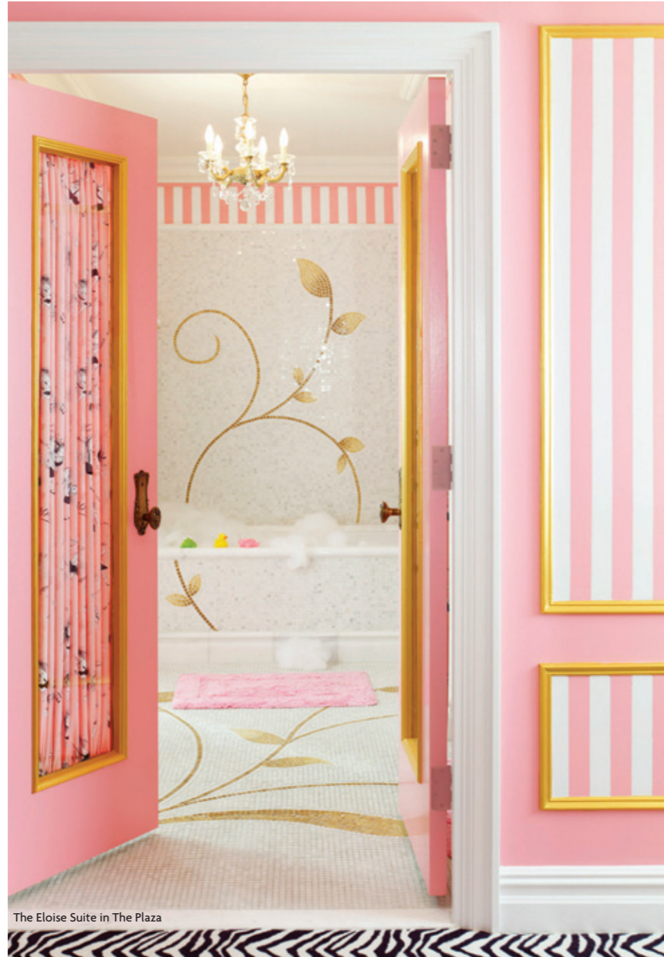
The Eloise Suite in The Plaza

THE GRANDE dame of New York City, The Plaza is also the setting of the children's book series, Eloise , whose eponymous character resides in the hotel. Now real-life children can live out their Eloise fantasies with a number of Eloise -themed activities, from a pyjama party brunch to ballet and yoga classes. The most outrageous of all the Eloise fun may be the Betsey Johnson-designed Eloise Suite, a two-bedroom wonderland of candy-striped wall panels, zebra-print carpets and a bedroom with glittering pink décor. The Eloise Suite from US$2,043 per night Tel: +1 646 599 8365; www.theplazany.com