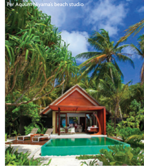
Per Aquum Niyama's beach studio

KIDS WILL BE BEGGING TO GO ONCE THEY CATCH WIND OF CASTAWAY CLUB HOUSE, A SPECIAL KIDS' CLUB ON THE ISLAND LOCATED IN A HUT