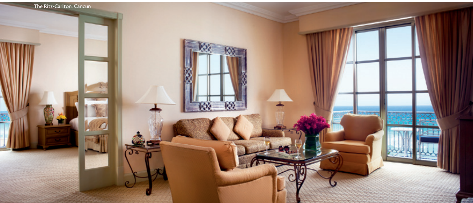
The Ritz-Carlton, Cancun

TRAVELLING FAMILIES need to keep their brood entertained and the Ritz Kids programme at Ritz-Carlton hotels around the world certainly delivers on that front. The offerings vary from hotel to hotel but one thing that remains a constant is the ability to create a menu of engaging experiences for kids aged four to 12. Ritz Kids isn't just another supervised hotel-based activity area but a menu of thoughtful and immersive activities dedicated to educating children about the world around them. And keeping in mind the brand's partnership with Jean-Michel Cousteau's Ocean Future's Society, trips to sea destinations like the new Ritz-Carlton, Aruba are