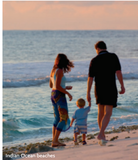
Indian Ocean beaches