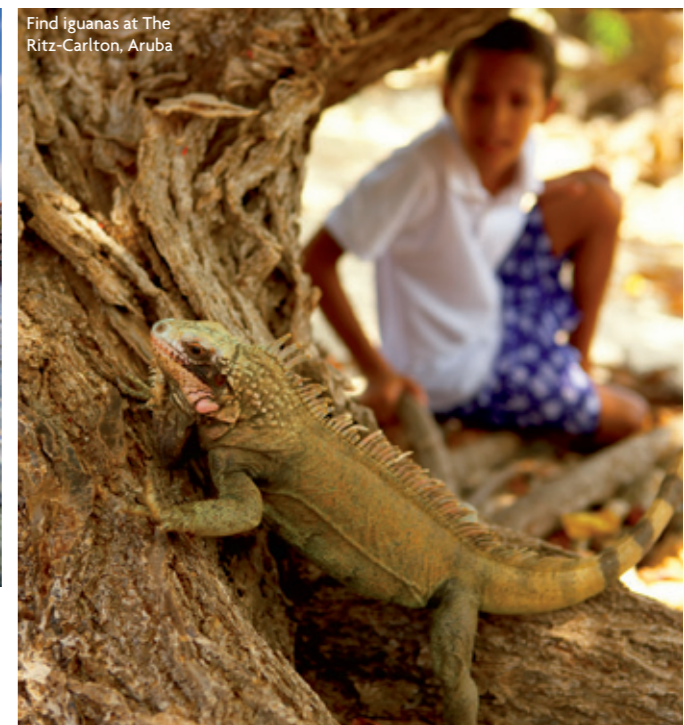
Find iguanas at The Ritz-Carlton, Aruba