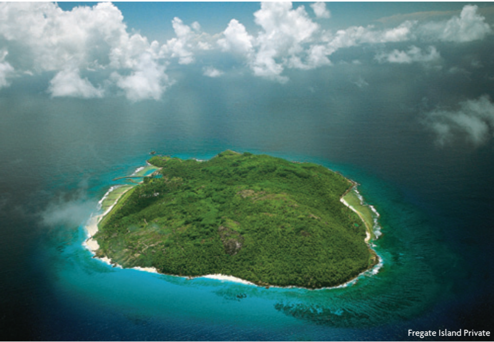
Fregate Island Private