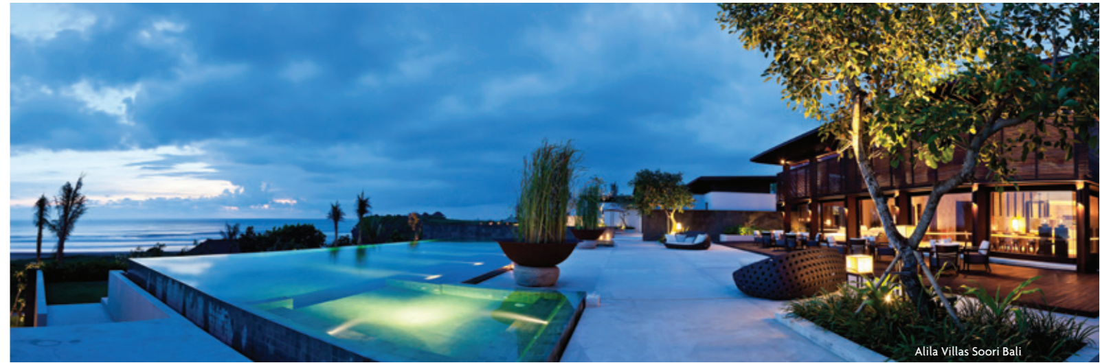
Alila Villas Soori Bali