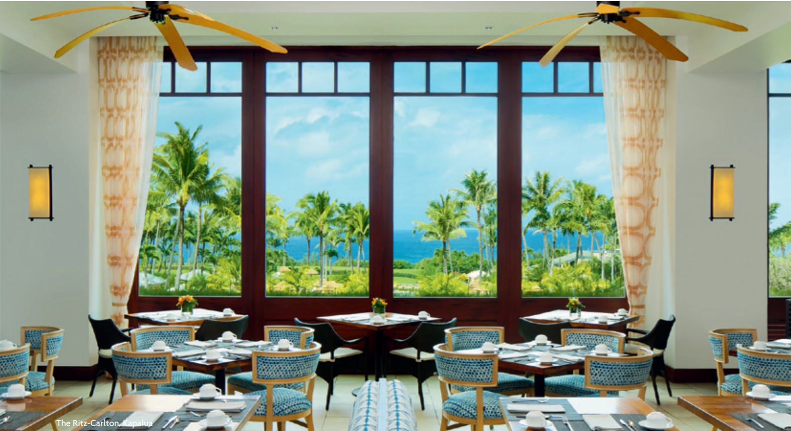
The Ritz-Carlton, Kapalua