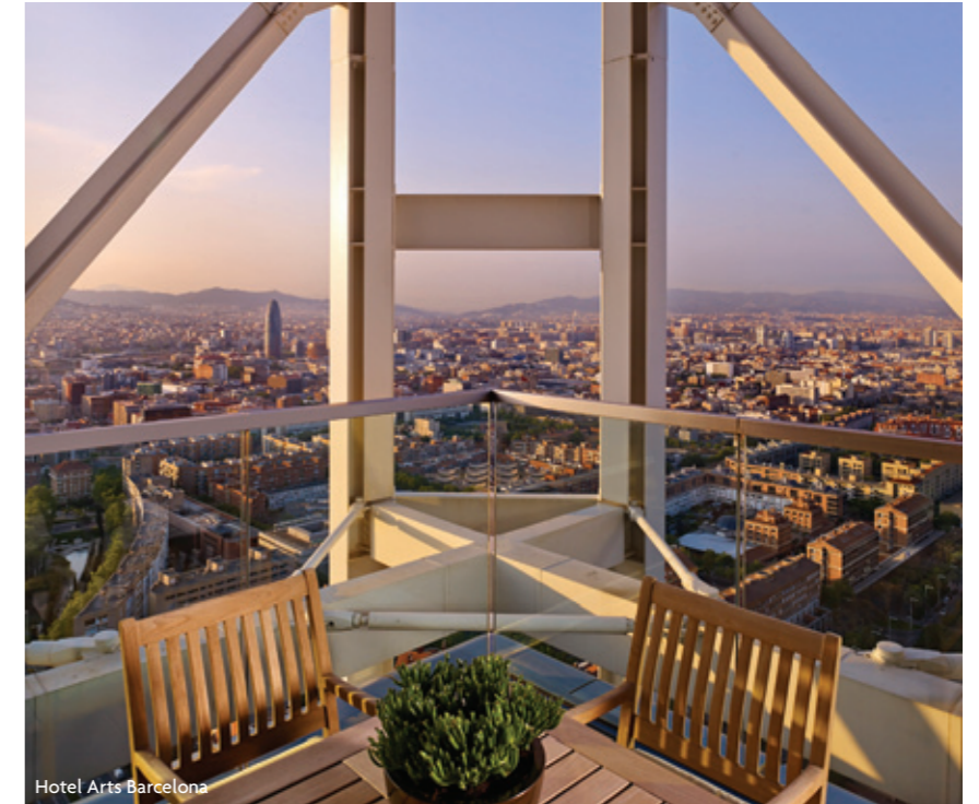
Hotel Arts Barcelona

SET UP A FAMILY pied-à-terre in Spain at Hotel Arts Barcelona in one of Europe's most cultural cities. The Luxury Family Package includes a two- or three-bedroom duplex apartment with a telescope and panoramic views of the sea and town. With plenty of family activities nearby (try the CosmoCaixa museum for science or the Museu de la Xocolata for chocolate lovers) a four-seat MINI Cooper included in the package makes local exploration easy, while kids can embark on a treasure hunt through the hotel and gardens. From: US$1,788 per night; Tel: +34 93 2211 1000 www.hotelartsbarcelona.com