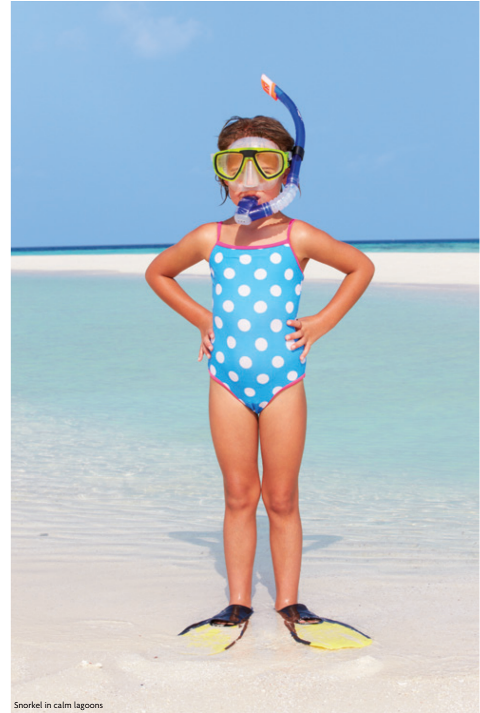
Snorkel in calm lagoons

DESIGNED BY the purveyor of luxury tours, Scott Dunn, Per Aquum Niyama has launched a new kids' island, home to the first kids' club in the Maldives to accept children under the age of three – a fact sure to elicit hoots of delight from the frazzled parents of toddlers. The aptly named Play island is fitted with two-bedroom family villas equipped with a nanny's room and two private pools, with a club split into four different age groups from 12 months to 12 years. With plenty of care-givers to watch over the little ones, activities revolve around learning about the Maldivian destination – a cornerstone of Scott Dunn's Explorers clubs – while theme days for the youngest, like Jungle Safari, Pirates & Princesses