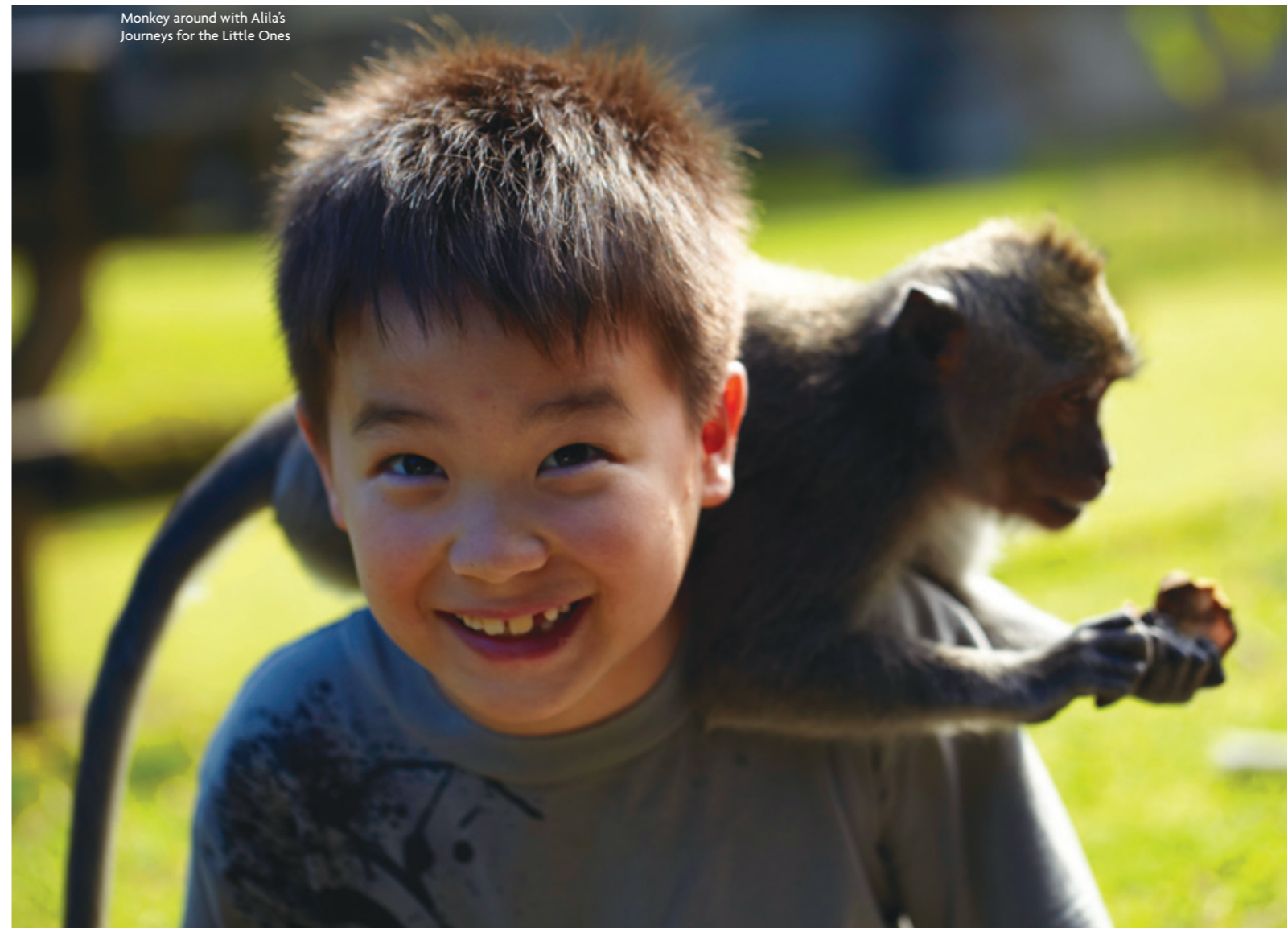
Monkey around with Alila’s Journeys for the Little Ones

From US$655 per night; Tel: +62 361 894 6388 www.alilahotels.com/soori