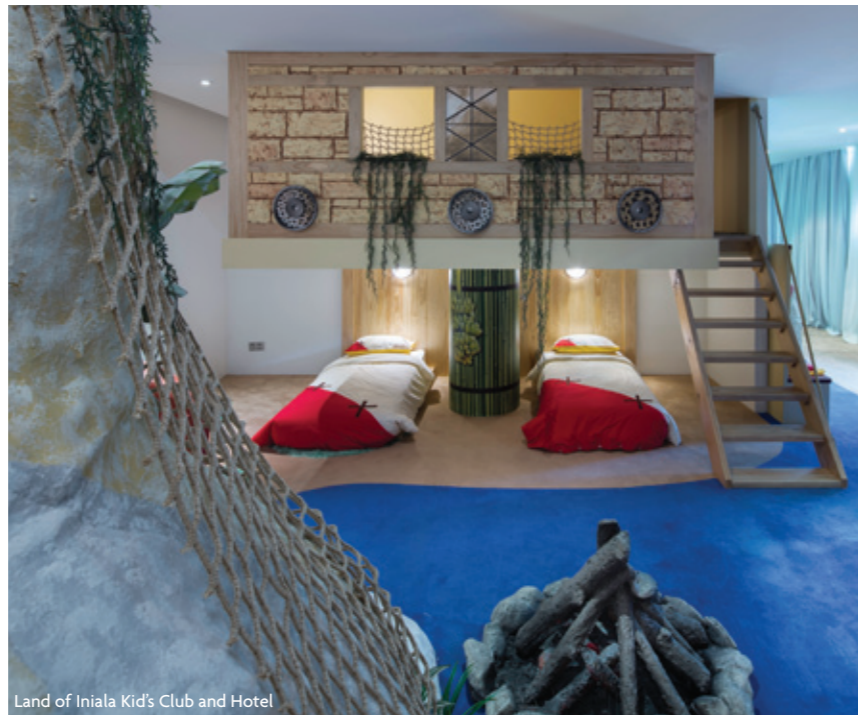
Land of Iniala Kid’s Club and Hotel

From US$1,395 per night; Tel: +66 76 451 456 www.iniala.com